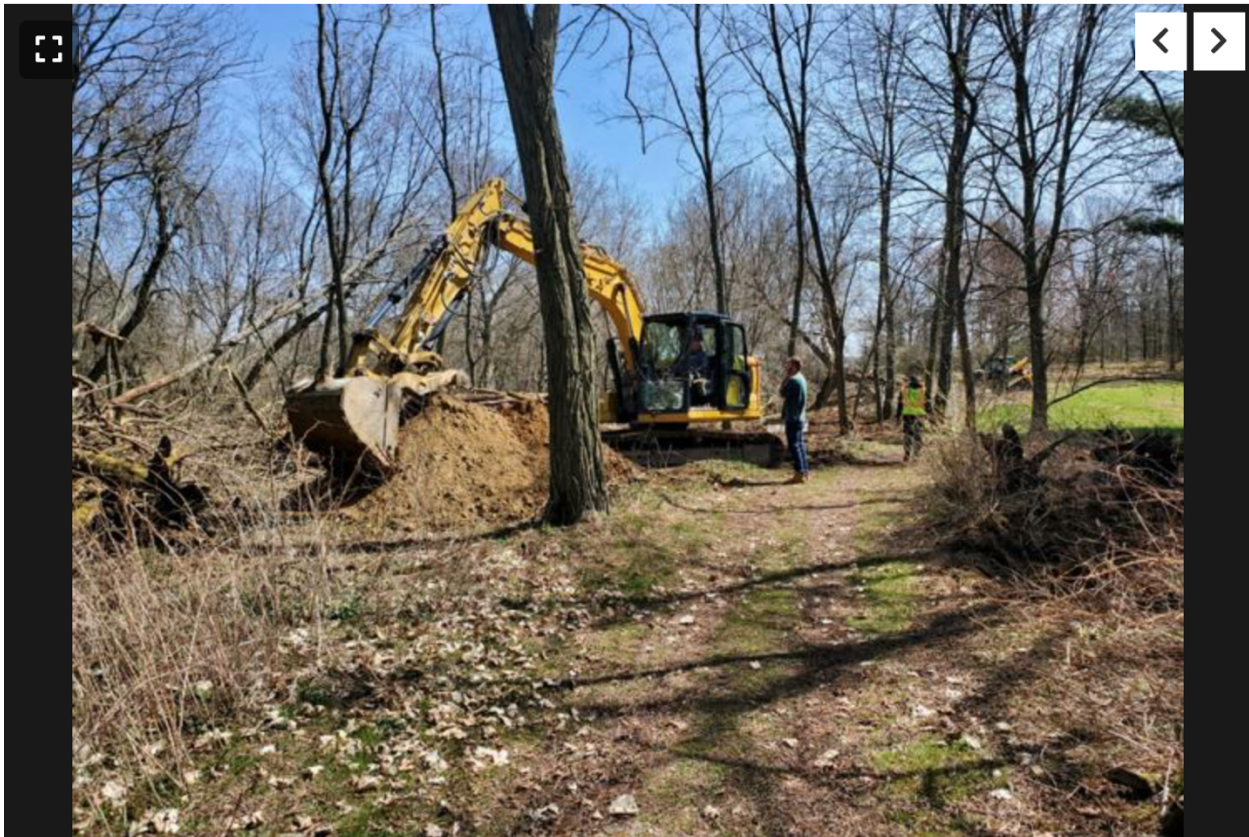
An excavator works on Carleton Island clearing trees in April on the Carleton Villa property.