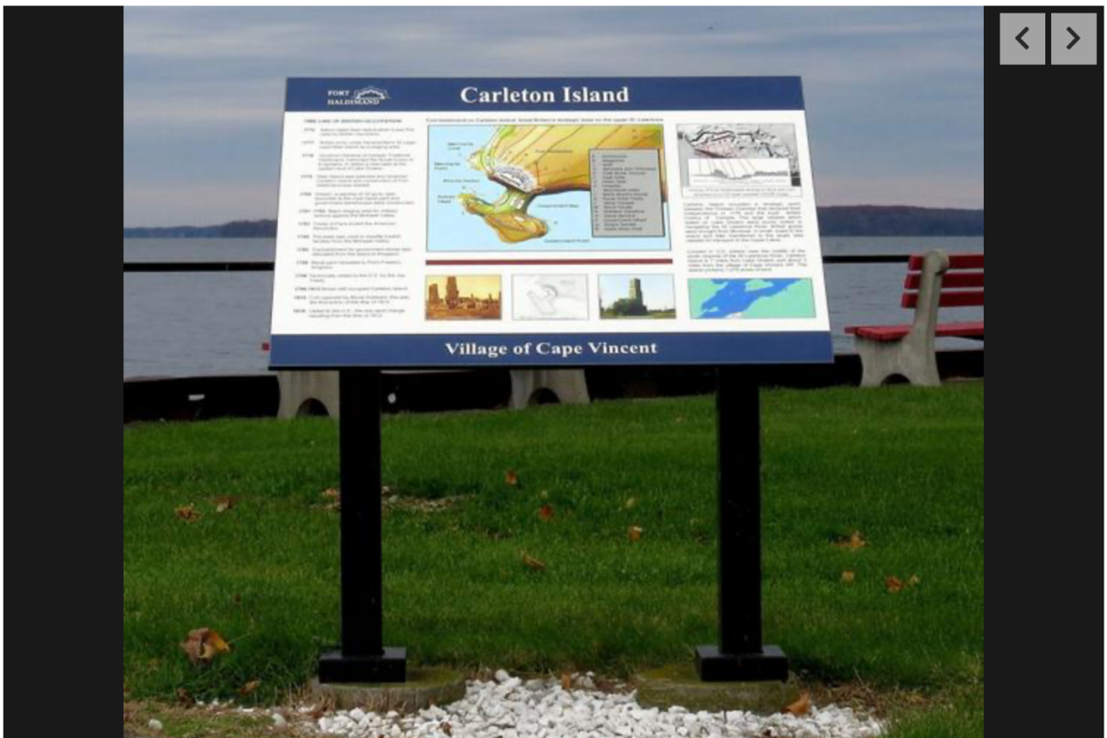
A panel on the history of Carleton Island and Fort Haldimand can be found at Cape Vincent's East End Park.