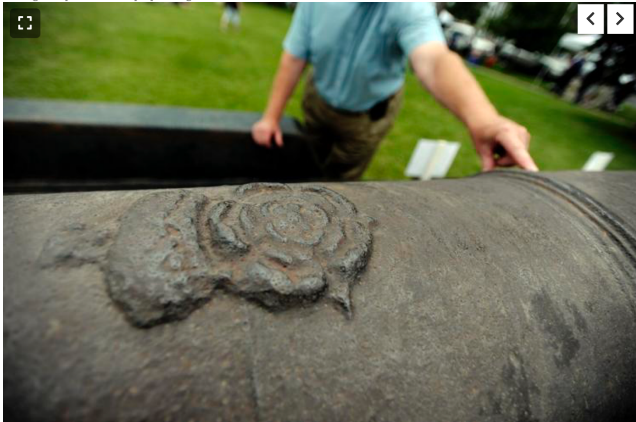
This cannon, salvaged from the St. Lawrence River near Carleton Island, was put on display in 2015 in Cape Vincent during a reenactment of a War of 1812 skirmish between British and American soldiers. Cast in Britain during the mid-17th century, it was sent to New York in November 1730 on the HMS Vanguard. It later was moved during the French and Indian War to Oswego or Fort William Henry before being captured by the French in 1756 or 1757 and recaptured by the British in 1760 at the Battle of Isle Royal near present-day Ogdensburg. During the American Revolution, it was moved from Fort William Augustus (Isle Royal) to Fort Haldimand on Carleton Island. It's now at East End Park in Cape Vincent.