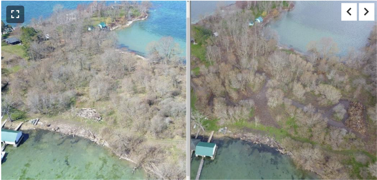
A before and after photo taken earlier this year of what Thousand Islands Land Trust says is clearing out of many trees and understorey on the Carleton Villa property.