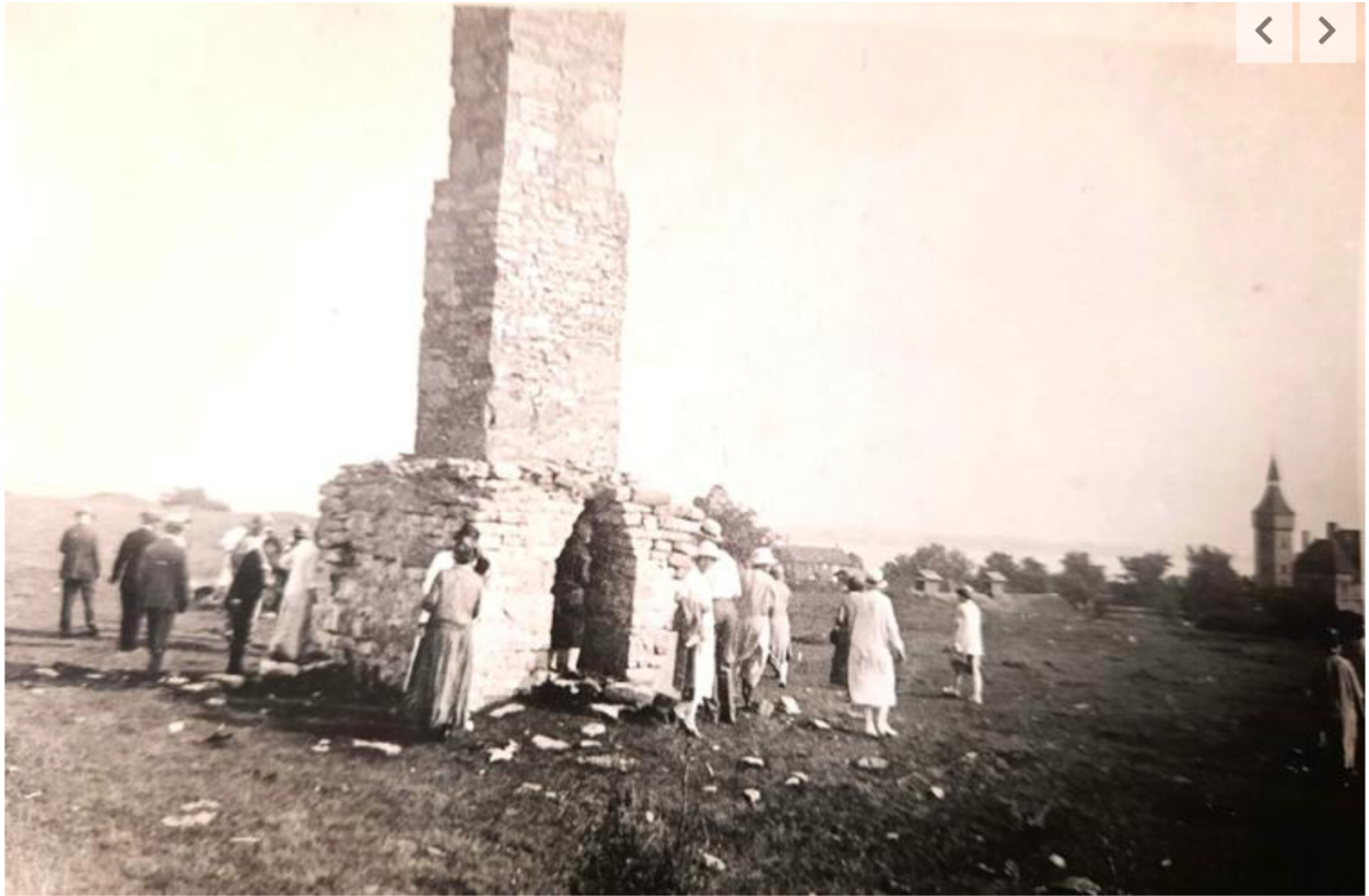
The Jefferson County Historical Society hosted a trip to Carleton Island in July 1926. This group explores chimney remnants of Fort Haldimand. The building sphere in the background on the right is a 111-foot high tower that was separate from Carleton Villa. "A brilliant gas light, long illuminated in the tower, became a range beacon for navigators passing down the American channel before the government protected the shoal off the head of the island by a light buoy," the reported.