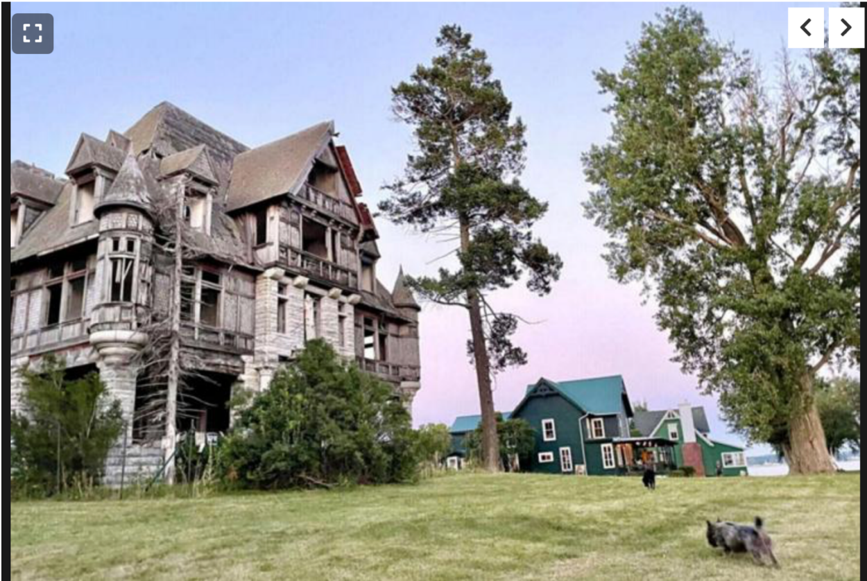
The state Department of Parks, Recreation and Historic Preservation issued a letter stating the Carleton Villa project may impact the historic nature of the island. Watertown Daily Times