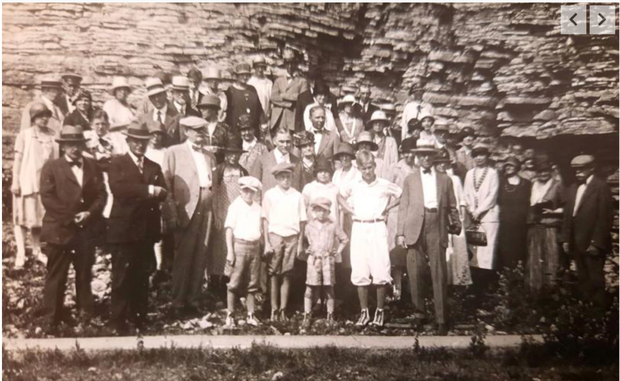
The Jefferson County Historical Society hosted a trip to Carleton Island in July of 1926. This group posed near layers of shelf-like rock on their way to Fort Haldimand.